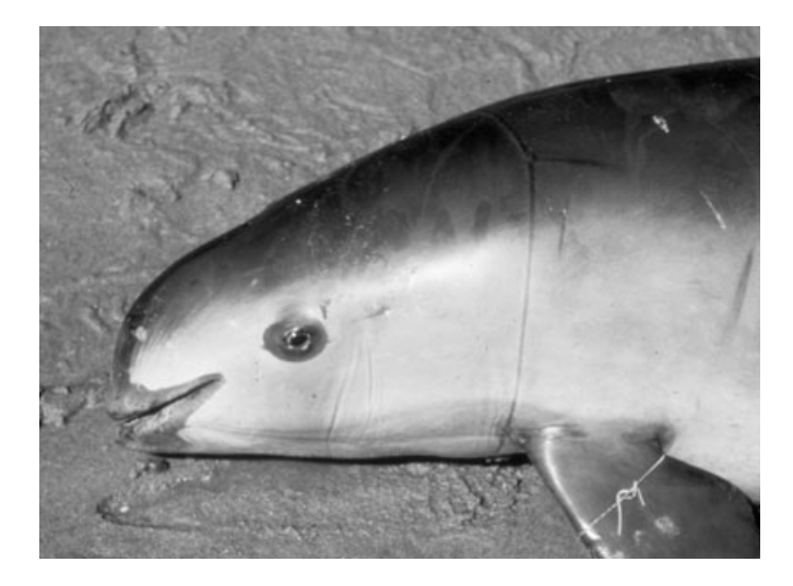
Fig. 1. A vaquita showing the head and anterior pigmentation pattern. Note the dark grey dorsal cape and the pale grey lateral field. The most conspicuous features are the relatively large black eye and lip patches. This animal died in an experimental totoaba fishery and was landed in El Golfo de Santa Clara, March 1985 (Photo by A. Robles).

Only four living species comprise the genus Phocoena , two in the Northern Hemisphere (the vaquita and the harbour porpoise P. phocoena ) and two in the Southern Hemisphere (the spectacled porpoise P. dioptrica and Burmeister's porpoise P. spinipinnis ). All are small in body size and coastal in distribution (although there is some evidence to suggest that the spectacled porpoise has a partly offshore distribution; Brownell & Clapham, 1999a). Another common feature of the four species is that they are highly vulnerable to incidental mortality in gillnet fisheries (Jefferson & Curry, 1994). There is no reason to suppose that the vaquita is any more, or less, susceptible to accidental entanglement in gill nets than any other