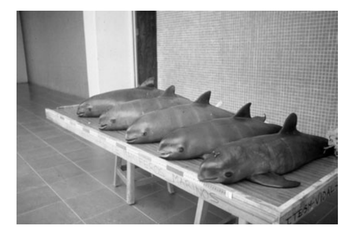
Fig. 4. Five vaquita calves awaiting necropsy at the ITESM-Guaymas laboratory. The calves were killed in gill nets set for totoaba, near El Golfo de Santa Clara, March-April 1991.