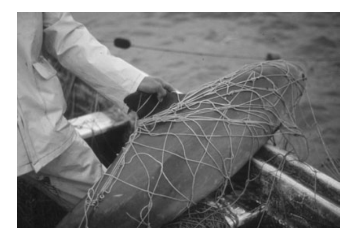
Fig. 5. A sexually and physically mature female vaquita (148.2 cm, 44 kg) killed in a gill net set illegally for totoaba near El Golfo de Santa Clara, 2 February 2002.

(a) Eliminate large-mesh gill nets (6-inch stretched mesh or greater);